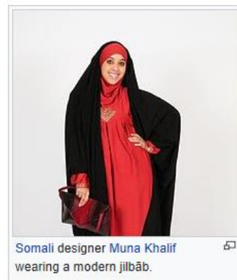
A modern khimar and jilbab

Whilst the instruction to women to cover their upper chests is associated in 24.31 with the modesty of the wearer - who is in the same verse told to ' guard her private parts ' (refrain from fornication), not to stamp her feet so as to jangle any ornaments, and to repent – in 33.59 a different reason is given. The explicit purpose given for this instruction is to enable the wearer to be ' recognised ' (presumably as a Muslim) and thereby to be afforded protection from being ' disturbed '.